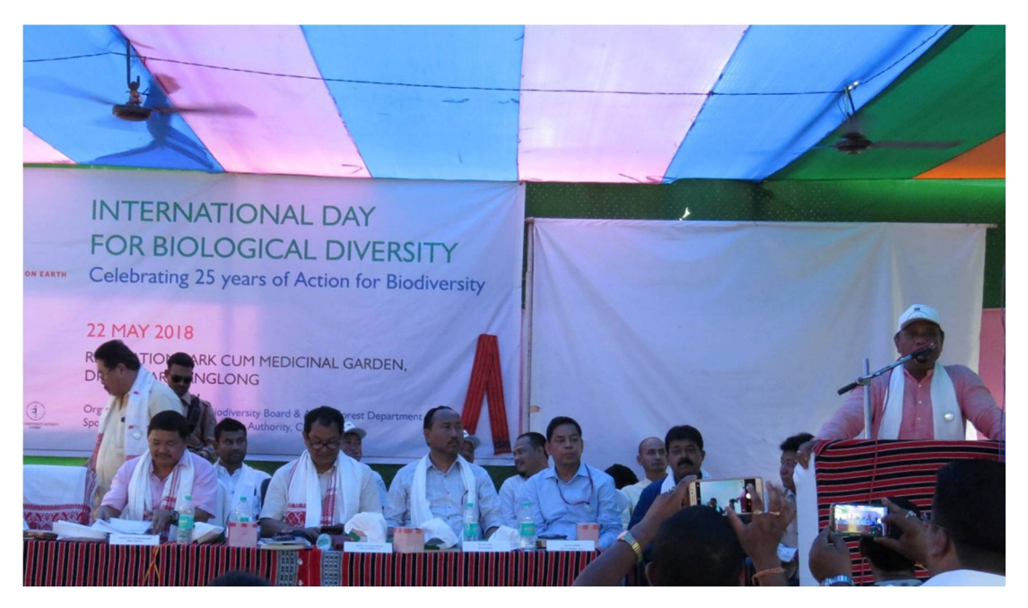
Address by Chief Guest Shri Parimal Suklabaidya, Hon'ble Minister (E &F), Assam