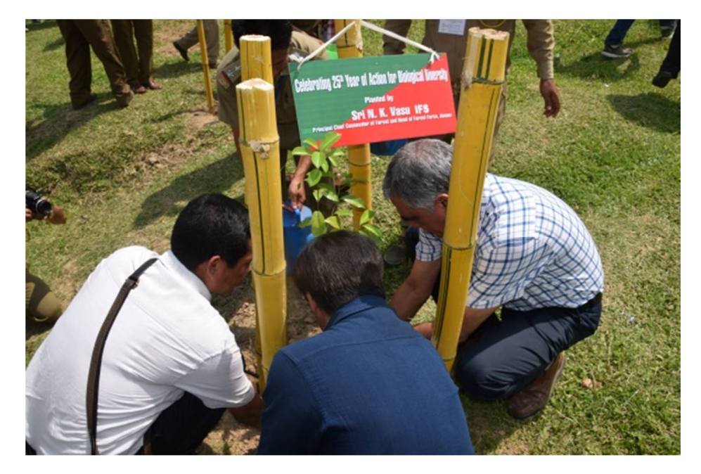
Plantation by PCCF & HoFF, Assam