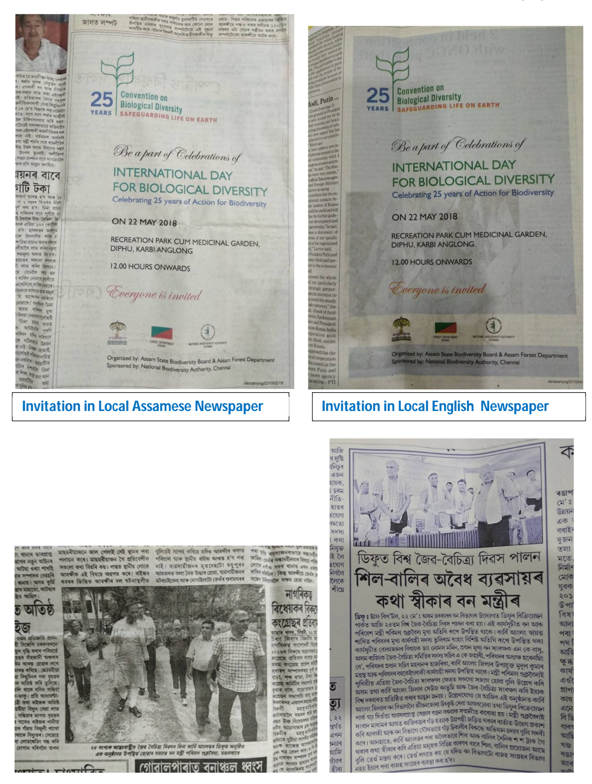
News of IDB Celebration in local Assamese Newspaper