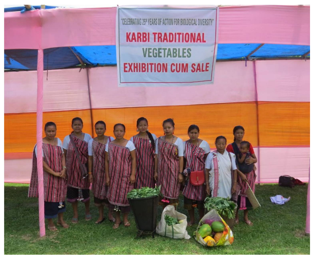
Local vegetables for exhibition by Ladies of Chingrum Self-Help Group

9. Exhibition by Self-Help Groups: There was an exhibition cum sale of local vegetables, traditional Karbi attire by the Self-Help Groups of Karbi Anglong.