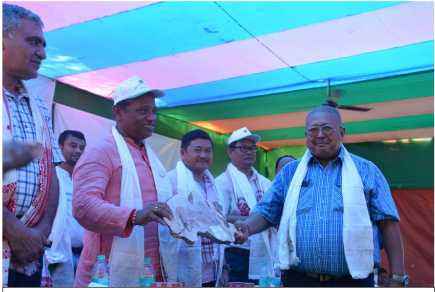
Special PCCF, Karbi Anglong presenting momento to Hon'ble Minister (E & F), Assam

Shri N. K. Vasu, IFS, Principal Chief Conservator of Forests & Head of Forests Force, Assam, Chief Guests of the function- Shri Parimal Suklabaidya, Hon'ble Minister, Environment & Forests, Government of Assam, and Shri Tuliram Ronghang, Hon'ble Chief Executive Member (CEM), Karbi Anglong Autonomous Council (KAAC) also addressed everyone present in the function and delivered their speech on conservation significance of biodiversity.