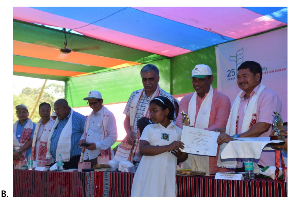
A & B: Students receiving certificates and prizes from Dignitaries