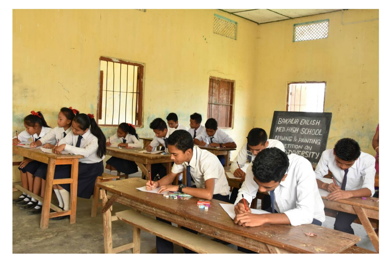
Students from various schools taking part in competitive events