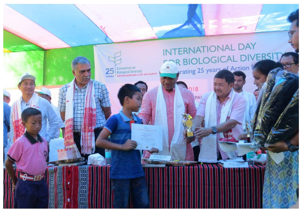
Students receiving certificates and prizes from Dignitaries

8. Program by children : Song and dance was performed by school children as a part of the function.