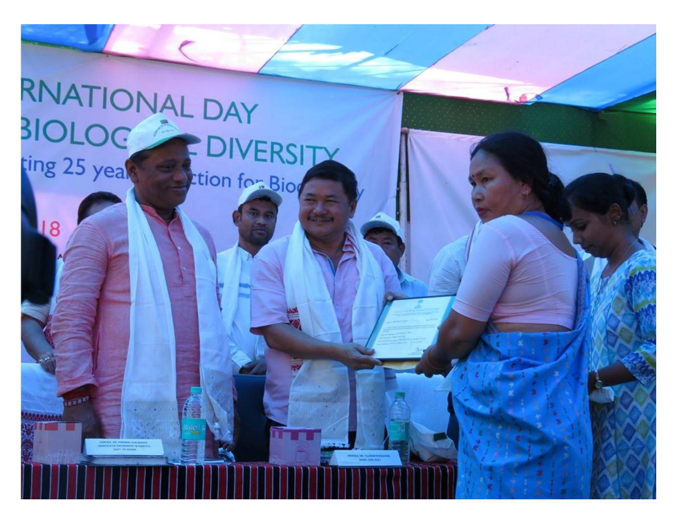
Representative of Langpher BMC receiving Certificate and startup grant from Hon'ble CEM, KAAC