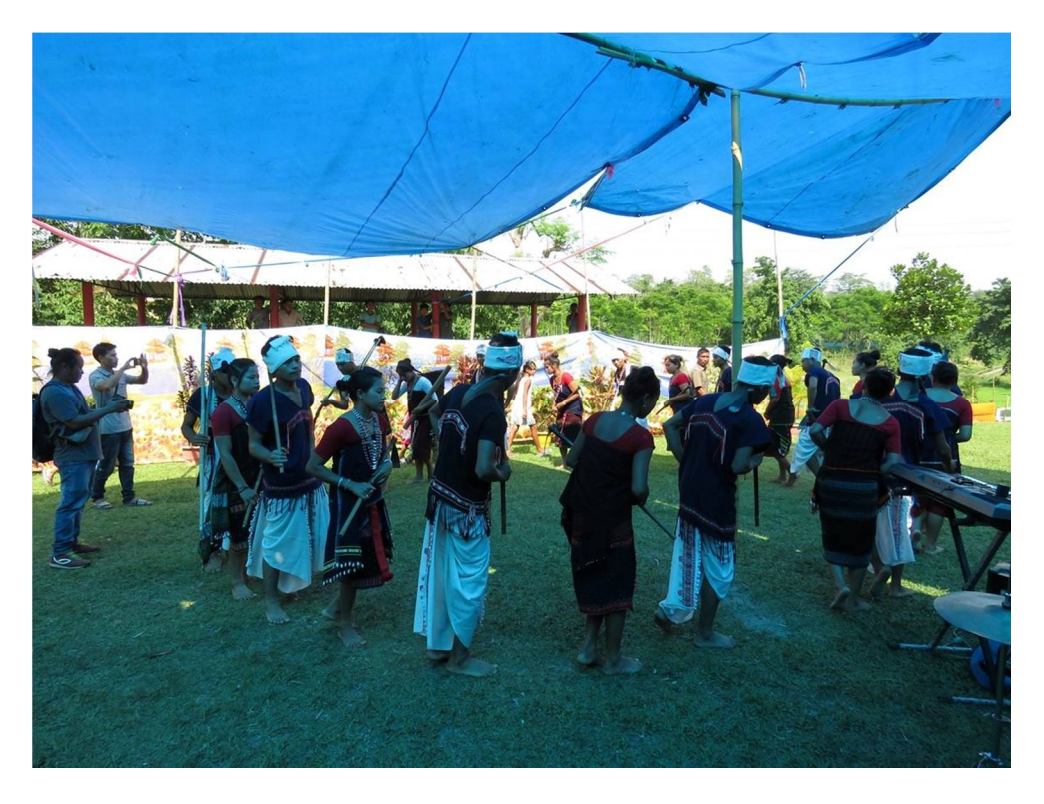
Karbi Dance Performance

9. Exhibition by Self-Help Groups: There was an exhibition cum sale of local vegetables, traditional Karbi attire by the Self-Help Groups of Karbi Anglong.