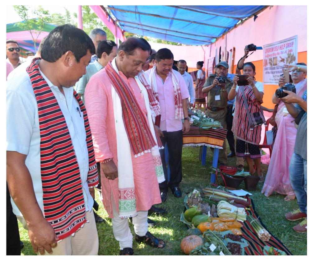
Dignitaries giving a look at the exhibition by Self-Help Groups

10. Seedling distribution : The program ended with free distribution of saplings to the local people and students.