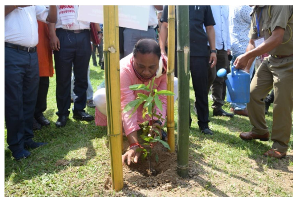
Plantation by Hon'ble Minister (E & F), Assam

2. Plantation : The inaugural of exhibition was followed by plantation of saplings by the Chief Guests, Forests Officials and other Dignitaries.